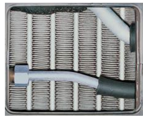
BG Climate Control Service restores heating/cooling efficiency and freshens interior air.

spores, fungi, road grime, nicotine oils and debris accumulate in your car's air conditioning evaporator.